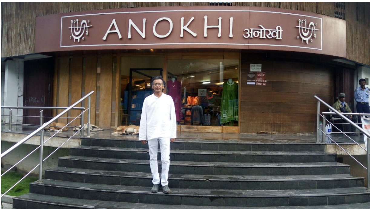
Pune, October 2017