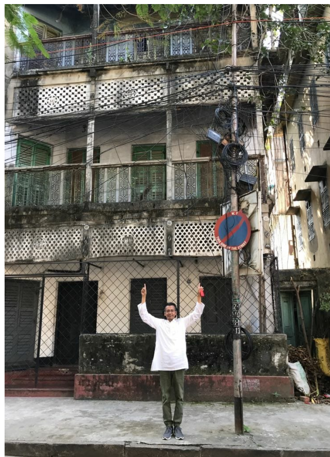
Returning after morning walk at the Lake, Kolkata, November '17