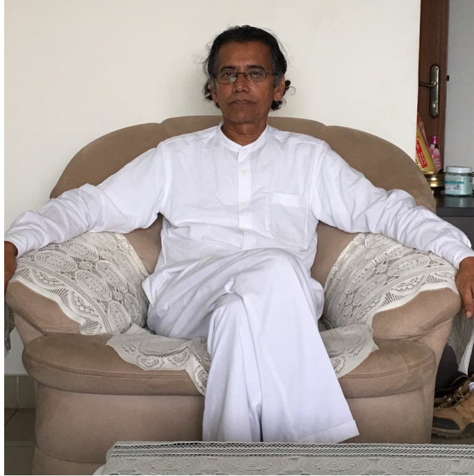
Cochin, October 2017