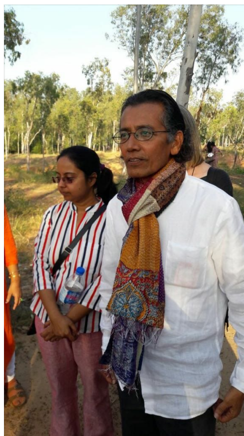
At a fair in Shantiniketan, November 2017